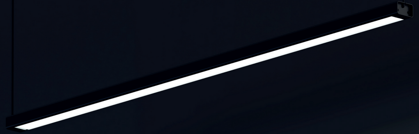
H LED 10690