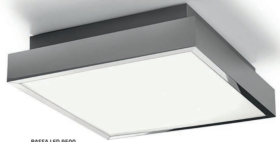
BASSA LED 9500