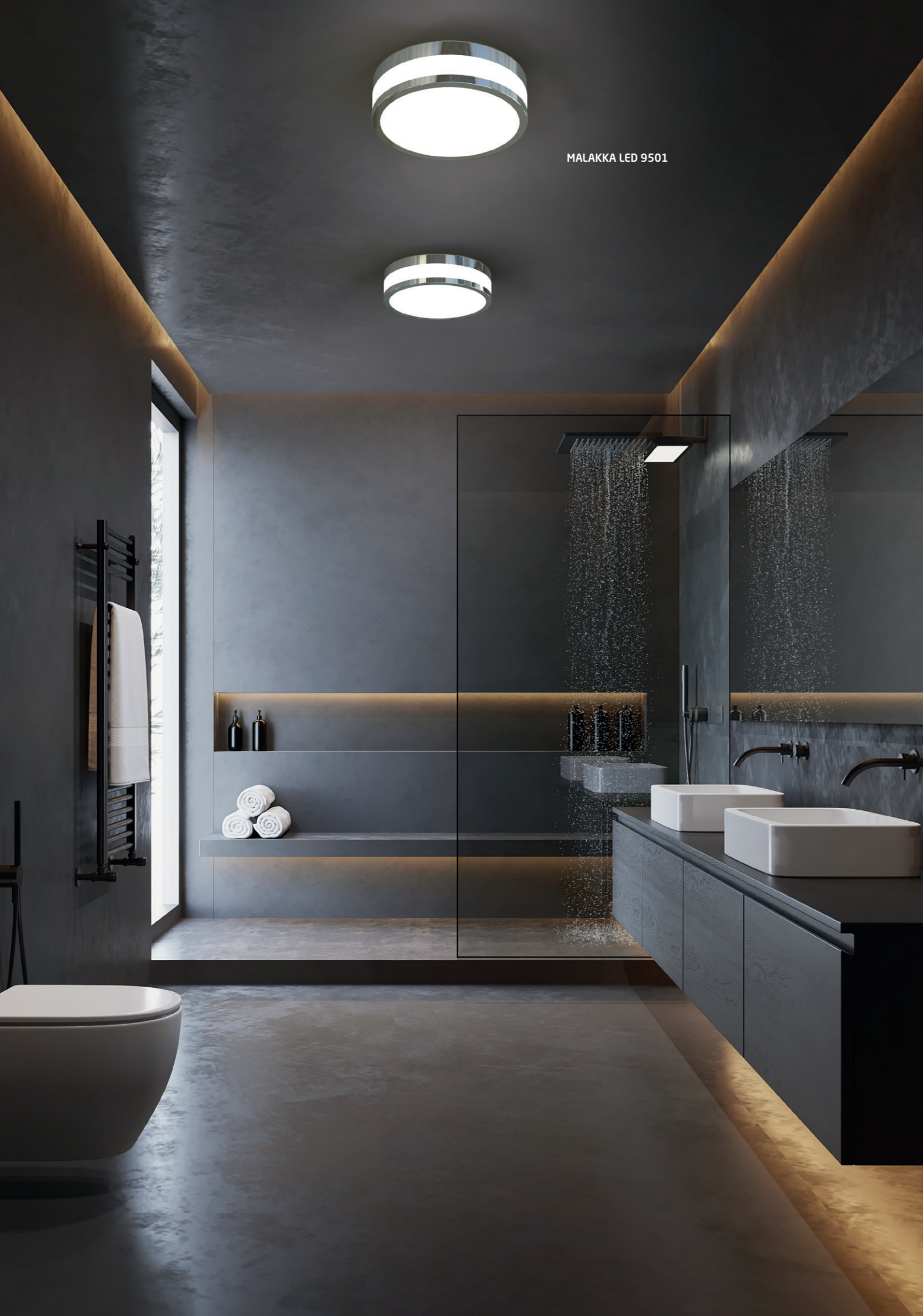
MALAKKA LED 9501