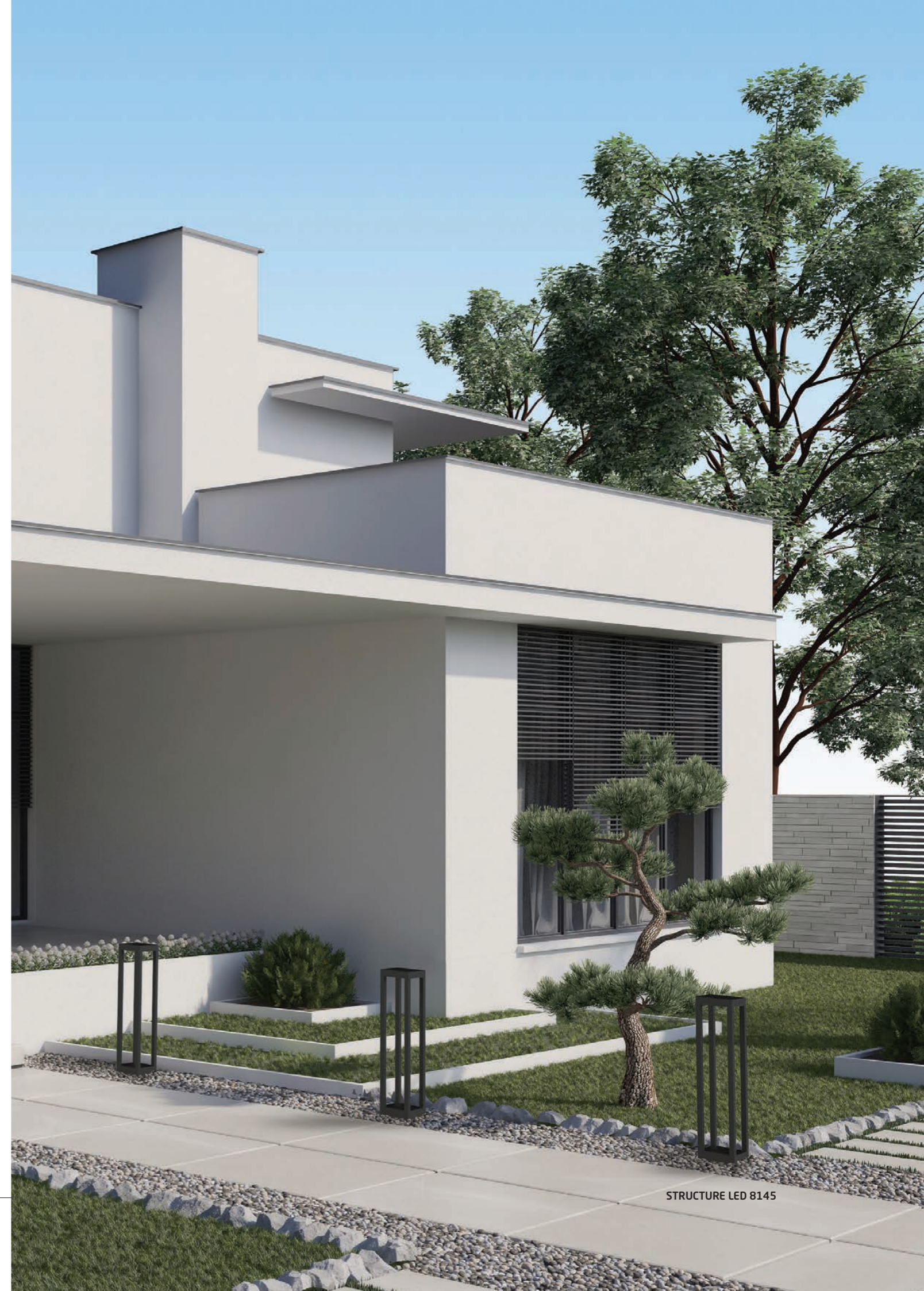
STRUCTURE LED 8145